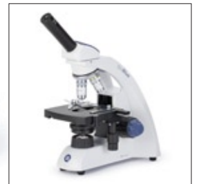
Monocular model BB.4220