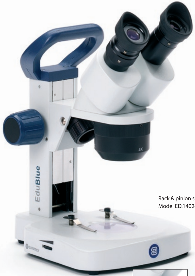
Rack & pinion stand Model ED.1402-S