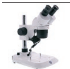
Pillar stand model SB.1402-P

The StereoBlue stereo microscopes are available in fixed dual magnification and zoom 0.7x to 4.5x magnification versions. For education, the amateur and suitable for many routine applications for the industry