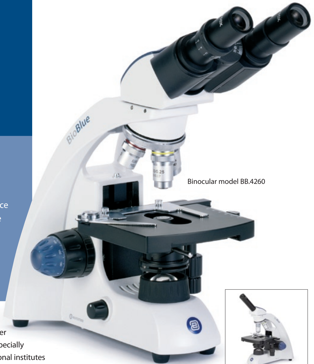
Binocular model BB.4260

The beautiful stylish design of the BioBlue series stands out among all other microscopes of this kind. It has been especially designed for biology classes of educational institutes and small laboratories and offer a full range of types