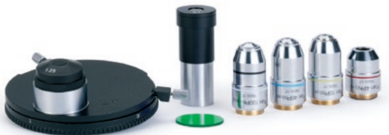
Phase contrast set

The BioBlue.Lab microscopes can also be supplied with IOS plan phase contrast objectives 10x / 20x / S40x / S100x, which are infinity corrected. These enhanced instruments are suitable for a wide variety of routine applications in laboratories and field microscopy